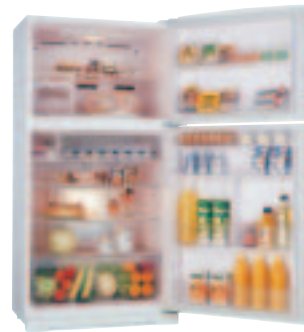
550L – Pure White R550ET3