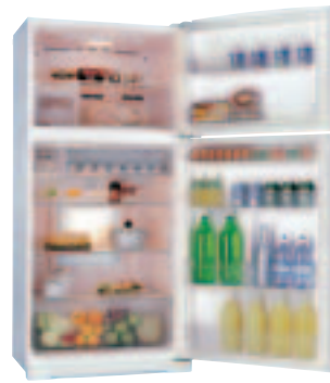
600L – Pure White R600ET3