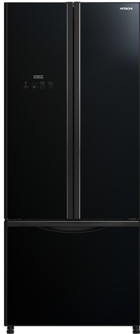
R-WB560PT9GBK Glass Black