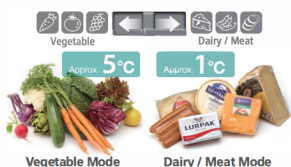
Vegetable Mode Dairy / Meat Mode

The Select Lever lets you adjust the inside temperature by switching between the two modes.