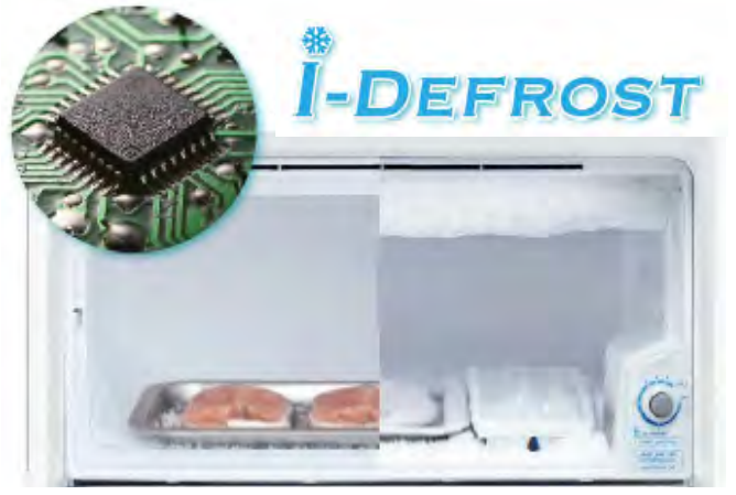
Simulation of i-DEFROST vs Non-Defrosted