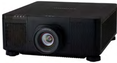
11 x LPWU9750 large venue projector