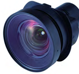
11 x USL901 Ultra Short Throw Lens