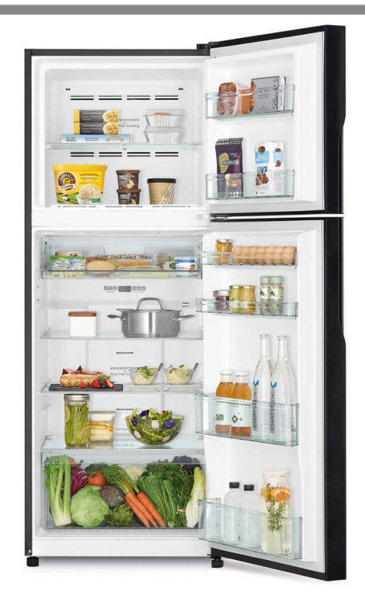
R-VX445PT9PWH White Finish