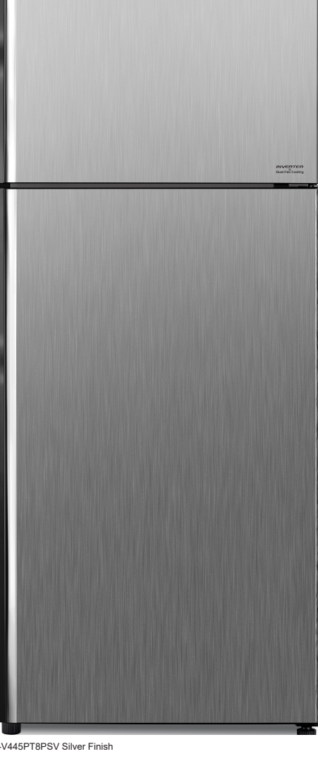
R-V445PT8PSV Silver Finish