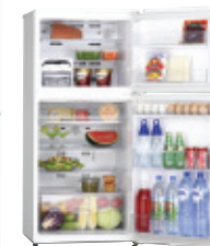
230L R-240AT3 PWH