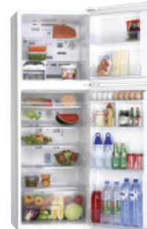
350L R-360AT3 PWH