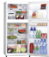
230L R-240AT3 PWH