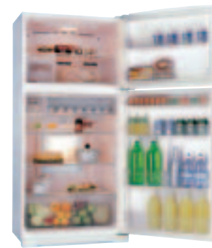
600L – Pure White R600ET3