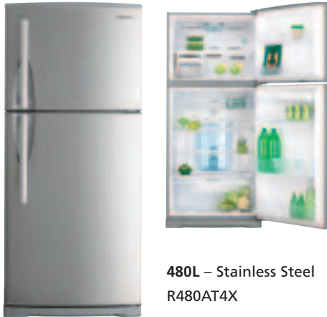
480L – Stainless Steel R480AT4X