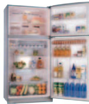
600L – Stainless Steel R600ET3X