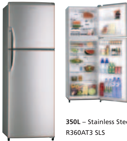
350L – Stainless Steel Look R360AT3 SLS