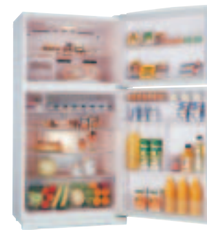
550L – Pure White R550ET3