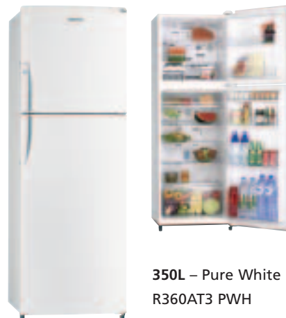
350L – Pure White R360AT3 PWH