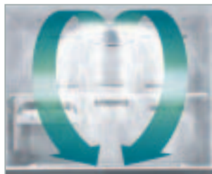
Multi-flow for 480 series shown. Other models may differ in flow pattern.

The advanced multi-flow air distribution system chills or freezes your food quickly and efficiently. The freezer evenly distributes air from both the front and the back while the refrigerator compartment delivers super cold air to multiple sides of the food at once. This system allows cold air to circulate evenly around the refrigerator to keep all areas at a consistent temperature.