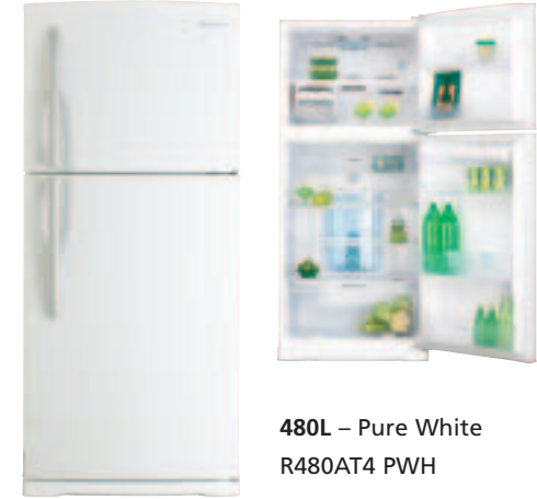
480L – Pure White R480AT4 PWH