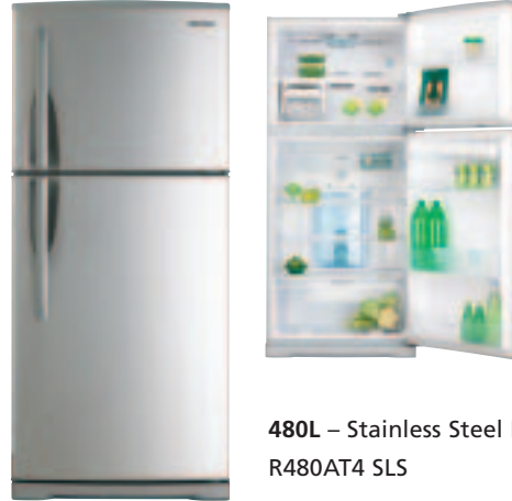
480L – Stainless Steel Look R480AT4 SLS