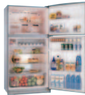
550L – Stainless Steel R550ET3X