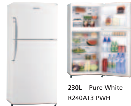
230L – Pure White R240AT3 PWH