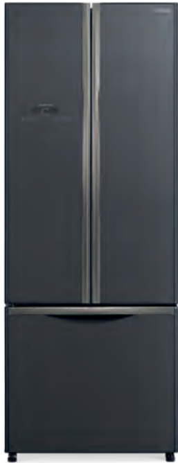
R-WG550PT2GGR Glass Grey