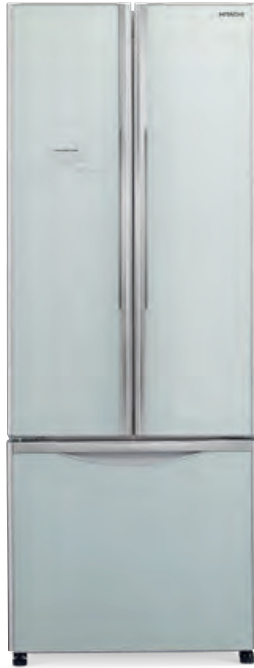
R-WG550PT2GS Glass Silver