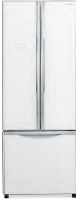
R-WG550PT2GPW Glass Pure White