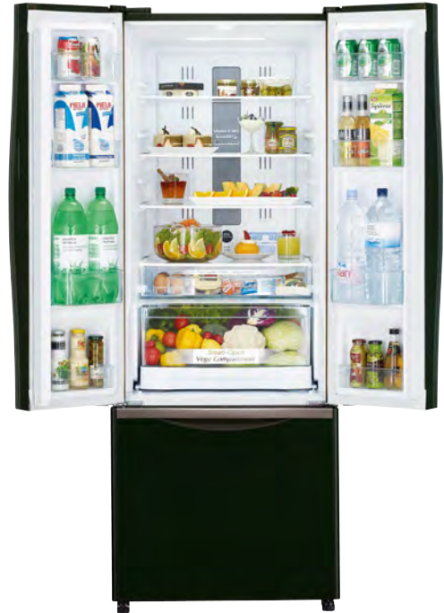
R-WG550PT2GBK Glass Black