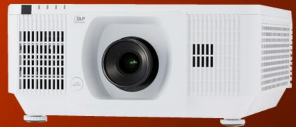
LPWU6600/ LPWU6700 model