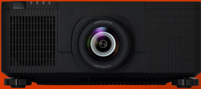
LPWU9750 / LPWU9100 model