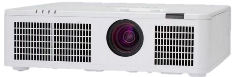
LPWU3500, LPWX3500 models