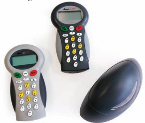
Verdict handsets with receiver