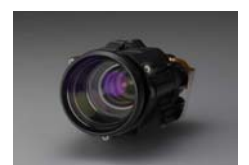
Full HD Lens

Hitachi Australia Pty Ltd (ABN 34 075 381 332)