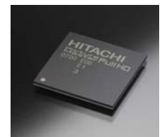
High Quality Audio/Video Codec LSI

ii) "High Quality Audio/Video Codec LSI" has a uniquely developed algorithm for high-quality motion picture. It switches process methods between field and frame in macro block depending on the amount of motion happening within the frame to process fine quality video image in scenes with a lot of action. The unique algorithm adaptively judges and switches encoding methods depending on the condition of images judged by the correlation of different frames, or predictions made from a single frame. The algorithm judges the amount of code to allocate by calculating how much picture quality deterioration can be recognized at playback.