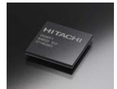
High Definition Camera Image Processing LSI

(3) "Picture Master Full HD" High Resolution Image Processing Engine consists of "High Resolution Camera Image Processing LSI for Full High Definition" which effectively processes the massive data captured by the 5.3 mega pixel CMOS image sensor, and "High Quality Audio/Video Codec LSI" which implemented MPEG4 AVC/H.264 CODEC, which is 1.5 to twice efficient compared with MPEG2.