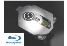
8cm BD/DVD Drive